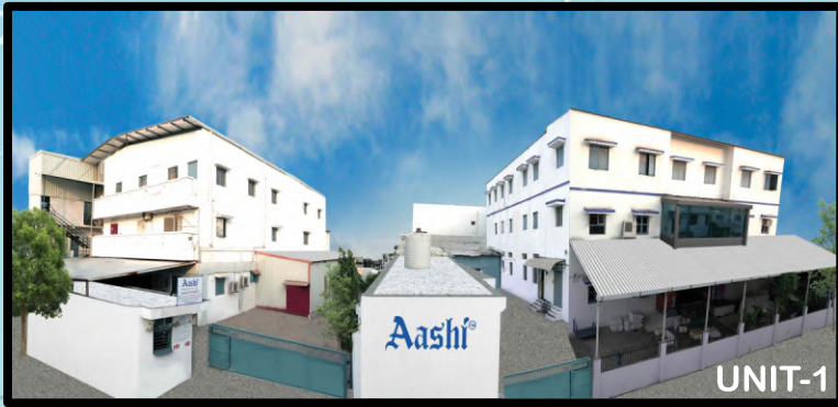
New Aashi Rainwear - 1

843/2, Nidhi Industrial Estate, Village- Rakanpur (Santej), Gandhinagar-382721. Gujarat