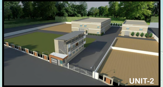
New Aashi Rainwear - 2

843/2, Nidhi Industrial Estate, Village- Rakanpur (Santej), Gandhinagar-382721. Gujarat