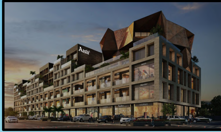
Corporate Office Building (Sindhu Bhavan Road, Ahmedabad)